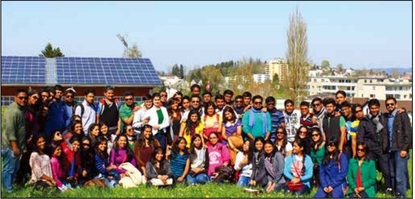
XIME Students at Munz Chococate Factory in Switzerland

XIME has brought meaning to the adage 'The whole world is a village' by initiating the International Study Tours for all the students.