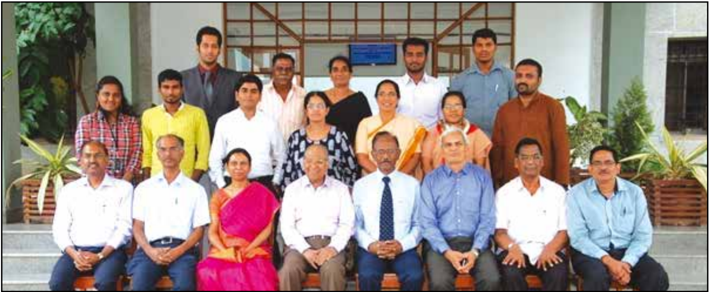
Participants of MDP on Enhancing Effectiveness of Voluntary Organizations

XIME's eighteenth Management Development Programme on Enhancing Effectiveness of Voluntary Organizations was conducted on July 23-25, 2015. Members from sixteen NGOs participated in the programme. Ramasamy Chinnamal Trust, Makkal Jagriti, Blue Cross of India, Samarthanam Trust, Don Bosco Care Home, Erin Foundation, Shree Ramana