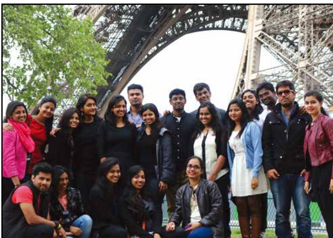
XIME Students in front of Eiffel Tower, Paris

In addition to visits to Universities and industries, students were exposed to different cultures, traditions, governance and ways of doing business. For most students this was their first visit abroad, and one that they would remember for life.