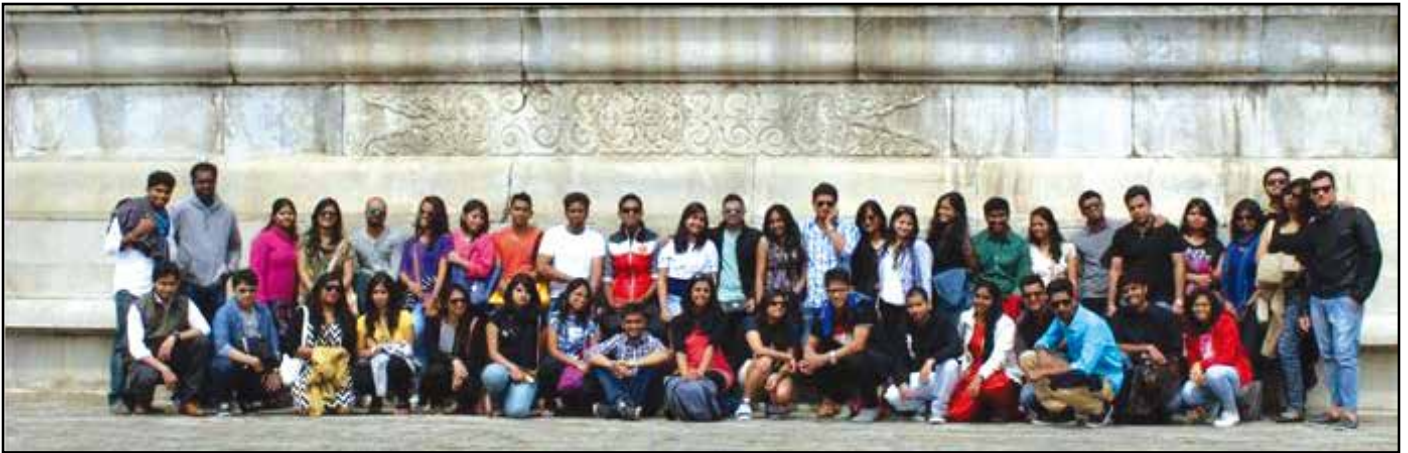
XIME Students in Forbidden City, Beijing

the technological advancements and infrastructural development in cities like Shanghai. The students visited Jiao Tong and Tsinghua Universities in Shanghai and Beijing respectively. They could witness steel sheets being manufactured at Bao Steel, Shanghai. They also visited Changyu Chateau Wine Manor, Beijing.