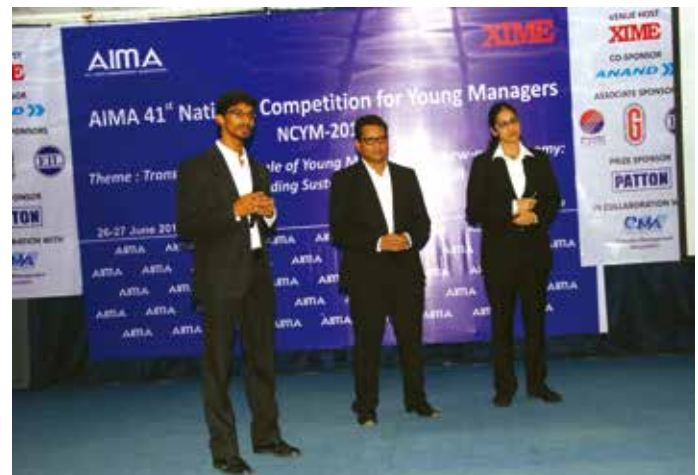
AIMA's NCYM at XIME

The first phase of AIMA's 41 st National Competition for Young Managers-2015, was held at XIME, Bangalore on 26 th and 27 th June. The topic of presentation was "Transformational role of young managers in a new age economy: Towards building sustainable organisation". There were teams of three young managers each from a total of twenty seven prominent companies like Aditya Birla, BHEL, Bosch, Indian Oil Corporation, ITC etc., presenting their views on the topic. The first position was awarded to Larsen & Turbo and the runners up was Water Health India. These two teams will participate in the national level finals on 8 th August.