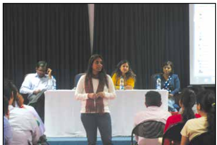
Alumni Panel interaction during the Orientation