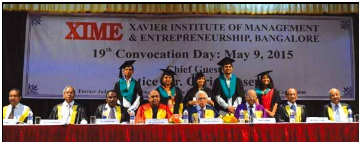
Award Winners with the Dignitaries at the Convocation