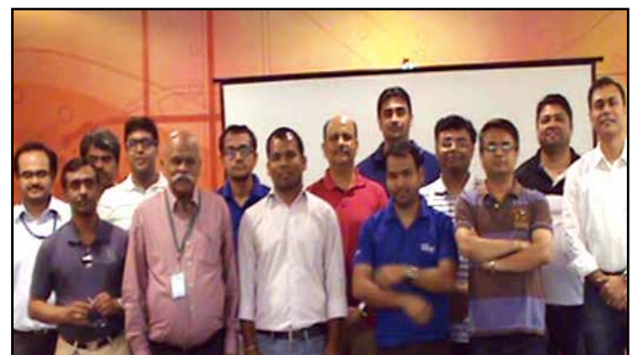
Participants of OBP at mjunction