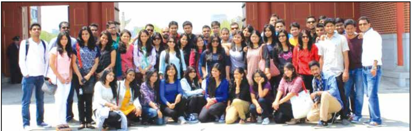
XIME Students at Guang Dong University in China

The 12 days and 11 nights study tour took them to Shanghai, Beijing, Macau and Hong Kong. The visit deepened their understanding of the culture as well as the history of China, and acquainted them with