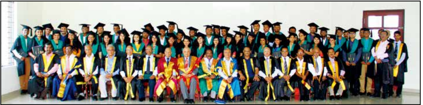
Graduates of First Batch – XIME Kochi with the Dignitaries at the Convocation