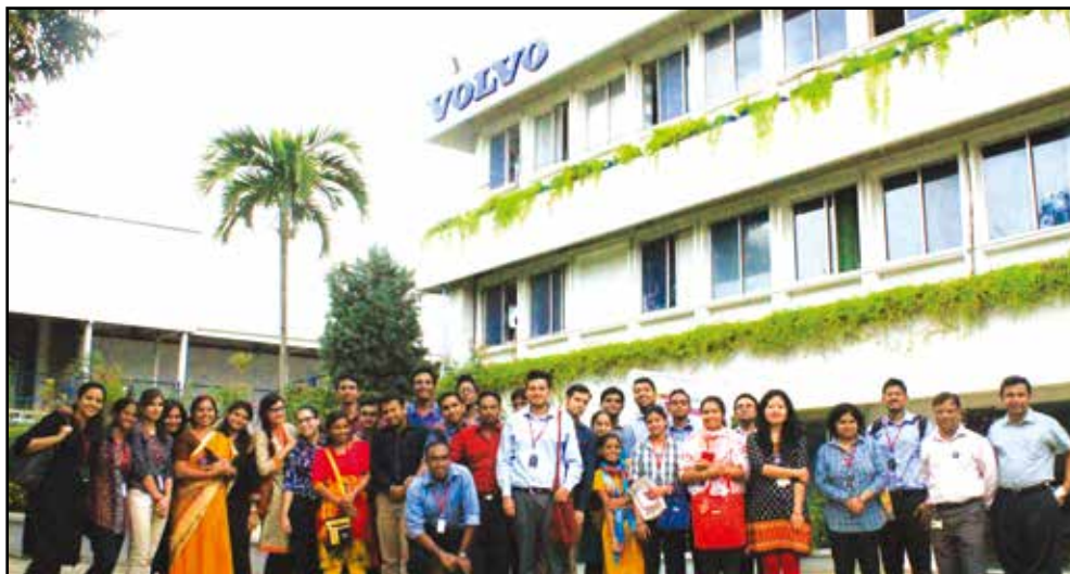
XIME students at Volvo Construction Equipments Pvt. Ltd

Two groups of students from Batch 21 visited Volvo Construction Equipments Pvt. Ltd. on 30 th and 31 st July. During these visits the students had an opportunity to learn about different functions of a construction equipment manufacturing company.