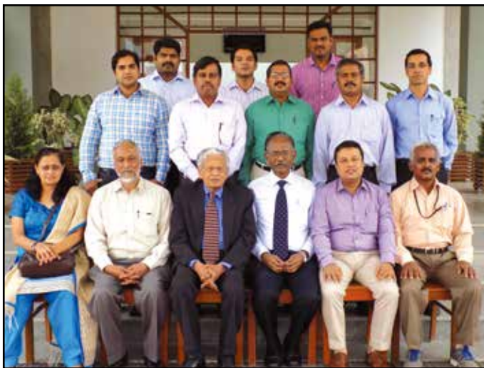
Participants of MDP on Knowledge Management for sustained growth