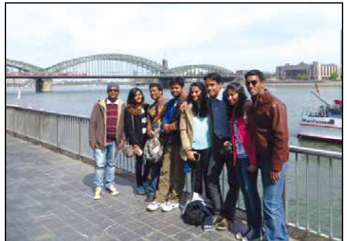
XIME Students at the bank of Rhine River, Cologne City, Germany