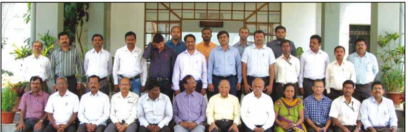
Participants of MDP (Innovation & Creativity)