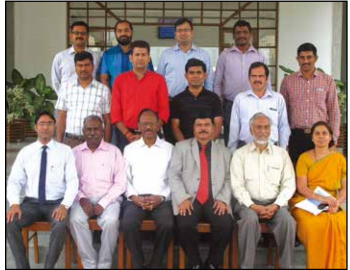
Participants of MDP on Simplifying Forex